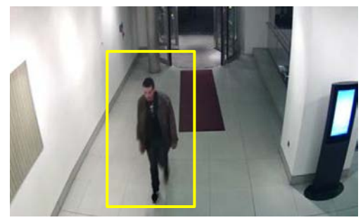
ROI(region of interested) Save streaming by allocating more bandwidth on the important monitoring area.